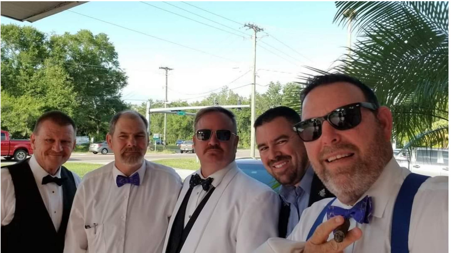
5/20: The Monthly Fish Fry! Another sellout performance for J.F. Swartsel Lodge! Thank you so much to the number of Brothers of JFS and Sisters of the Star who make this event a success month after month! The community has obviously missed us, and I've missed our amazing fish!