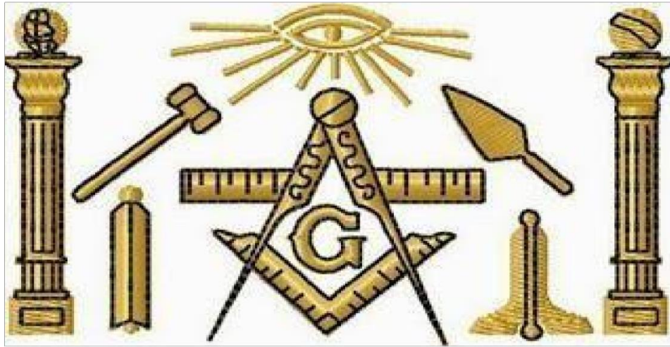
J. F. Swartsel lodge No. 251 F. & A.M. Trestleboard

Published monthly Volume MMXX Issue No. 12 – December 2020 AD, 6020 AL