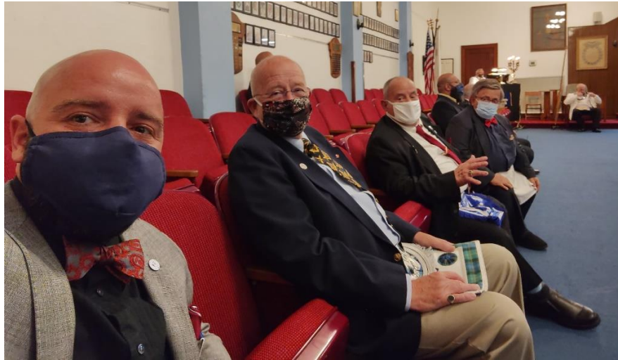
Brothers from JFS participated in the Annual Outdoor Degree (indoors due to Hurricane Eda) on 11/13, and the very next day we hosted an MLT session in person and via zoom for Zone 4 and beyond!