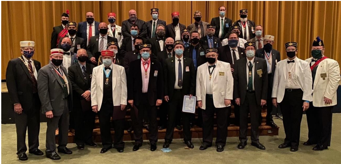
On 11/12, we traveled to visit our District 18 Brothers for Tarpon Lodge No. 112's DDGM Official Visit