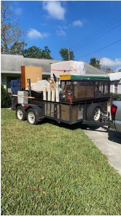
Helping one of our Widows move