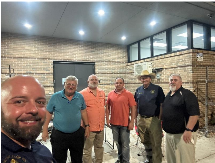
Working a drop site for the City of Tampa Election