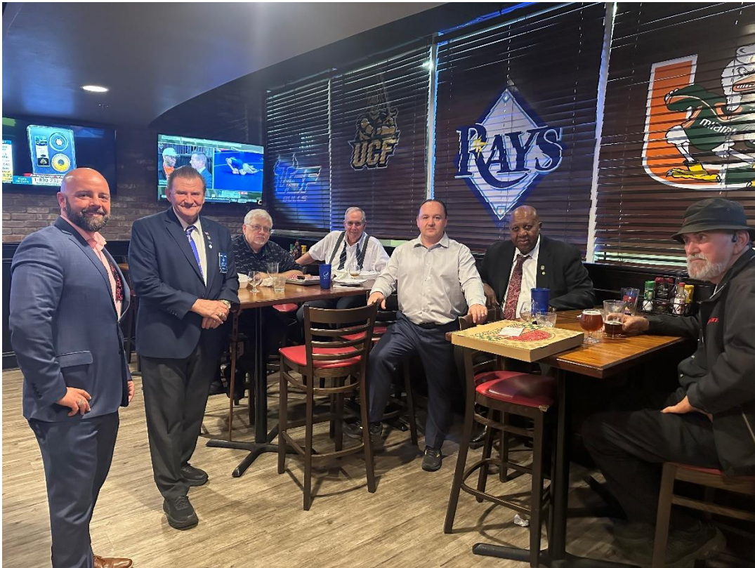
3/16/2023 – Post meeting fellowship